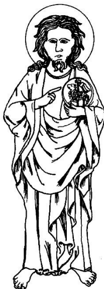
St. John the Baptist